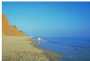
Fig 2. Original image

Qtdecomp divides a square image into four equal-sized square blocks, and then tests each block to see if it meets some criterion of homogeneity. If a block meets the criterion, it is not divided any further. If it does not meet the criterion, it is subdivided again into four blocks, and the test criterion is applied to those blocks. This process is repeated iteratively until each block meets the criterion. The result may have blocks of several different sizes.