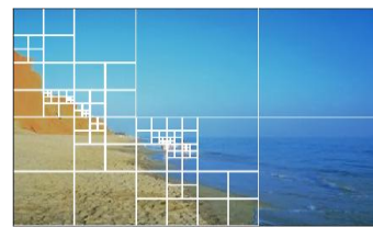
Fig 3. Quadtree decomposition of Fig 2

In the above figure Fig .2 Original image is given which can be further processed for quad tree segmentation. The result of quadtree decomposition is shown in Fig. 3. It shows subdivision of image into homogeneous blocks. The decomposed image is further used for histogram computation.